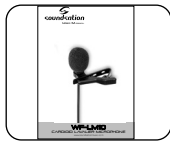
This User Manual

PLEASE NOTE : Technical specifications and appearance subject to change without notice. The information contained herein is correct at the time of printing. Please consult the Bodypack Connectors Compatibility Chart on the product page ( www.soundsationmusic.com )