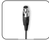
3-pin mini-XLR connector (SOU0143)