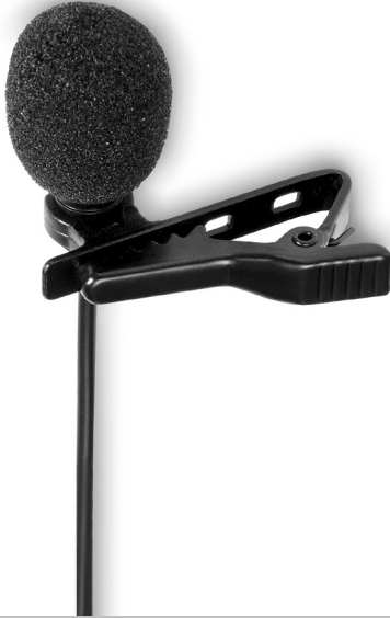
WF-LM10 CARDIOID LAVALIER MICROPHONE www.soundsationmusic.com