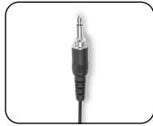
3.5mm TS Screw-lock Jack (SOU0030)