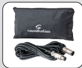
Microphone bag + Cable (XLR-F - XLR-M, 5m)