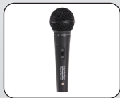
VOCAL 300 Microphone